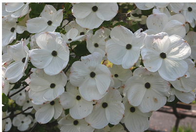
Eddies White Wonder Dogwood

Note some other trees as well as we go from May into June. There are a few lovely Dogwood specimens planted in a number of spots at the Arboretum and they will be blooming starting in May. There is a lovely Eddie's White Wonder Dogwood ( Cornus nutallii ) specimen planted in the lawn that will be sporting huge white flowers. This is a more disease resistant cultivar of our native Pacific Dogwood and puts on quite a show! Korean Dogwoods ( Cornus kousa ) are planted in numerous locations and are my personal favorites. These bloom a bit later in June and July and have literally hundreds of star shaped white flowers that cover their branches. Adding interest are the strawberry like fruits that develop over the summer. This type of Dogwood offers superior disease resistance as well. Be sure to see the variegated leaf from Wolf Eyes down near the gazebo - the white and green leaves are simply stunning!