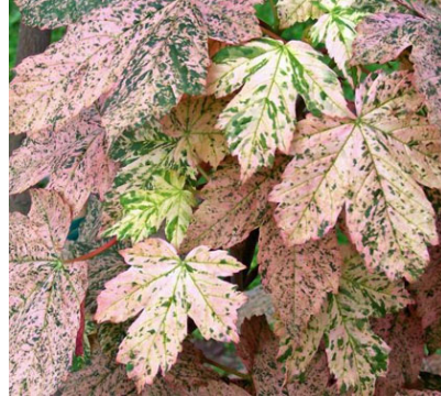
Eskimo Sunset Sycamore Maple

Goldenchain Tree ( Laburnum x 'Vossi' ) looks incredible when it drops its huge yellow flower clusters. Most folks think it looks like a giant yellow Wisteria tree!