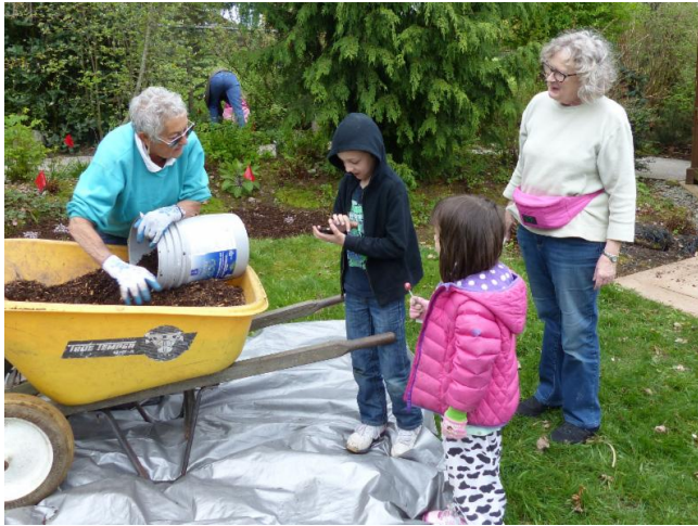
2017 Native Plant Fest